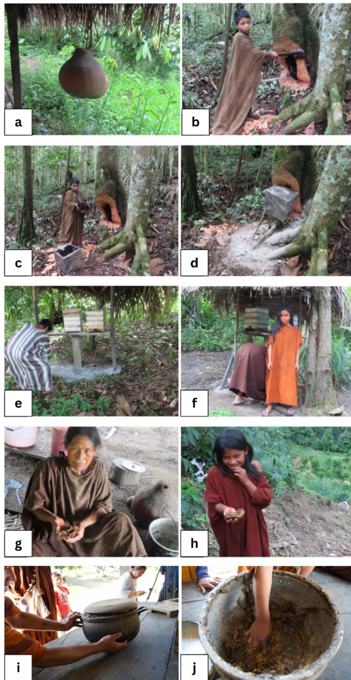
Figure 2. Management of stingless bees in the Ashaninka communities of Marontoari and Pichiquia: a) Raising of Tetragonisca angustula bees in the "chonkorina" fruit of Cucurbita moschata , b) An Ashaninka child opening a bee nest to collect honey and retrieve the colony without cutting down the tree, c) Transfer of the colony from a tree to a rational hive, d) A rational hive placed next to a tree to facilitate the entry of all flying bees into the hive, next to tree ashes used to control pests, e) Rational hives with bees placed inside agroforestry systems, f) An Ashaninka woman collecting honey and consuming larvae and honey of T. angustula , g) An Ashaninka woman holding honey and honey pots recently harvested, h) An Ashaninka girl enjoying recently harvested honey, i) An alternative method of raising T. angustula bees in cooking pots, i) An Ashaninka child enjoying honey collected in the cooking pot.