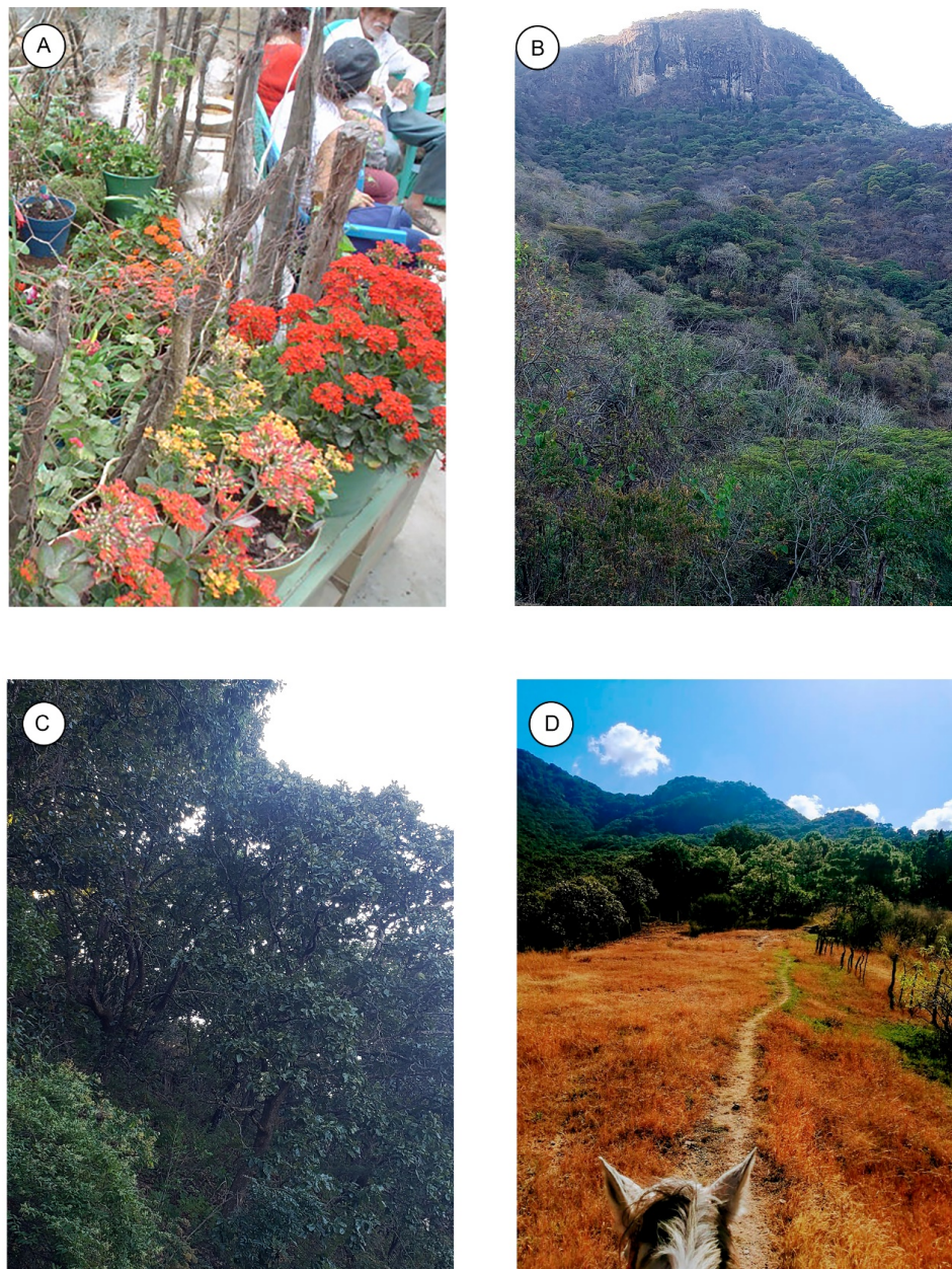
Figure 2. Socioecological systems in the “El Zapote” community, Central Mexico. A. Homegardens. B. Transitional zone between tropical deciduous forest and oak forest. C. Oak Forest. D. Farmland with forest patches on the edge.

for each species by the total number of informants. The calculation was made based on the following algorithms: UV_s = \frac{(\sum UV_{is})}{(ni)} , where: UV_s is the use value for a species among all the informants, UV_{is} are all the uses mentioned by each person for a plant specifically, and n_i is the total number of informants interviewed for the species.