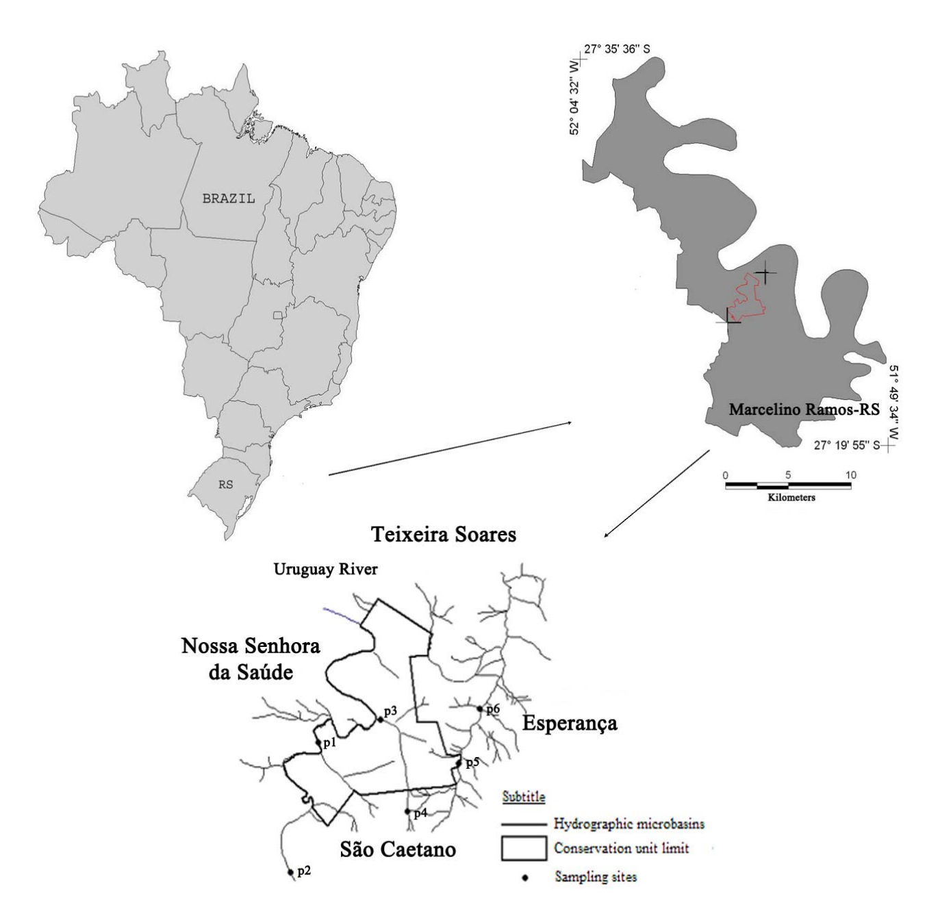
Figure 1. Localization and distribution of sampling sites and surrounding communities for the current study of the Mata do Rio Uruguai Teixeira Soares Municipal Natural Park (PTS).

to the detriment of local and regional urban centers (Socioambental 2001). The research was conducted in march and october 2009 and, involved two stages. The first stage was to analyze the LEK of the communities surrounding the PTS, whereas the second was to evaluate the water quality within and outside the PTS.