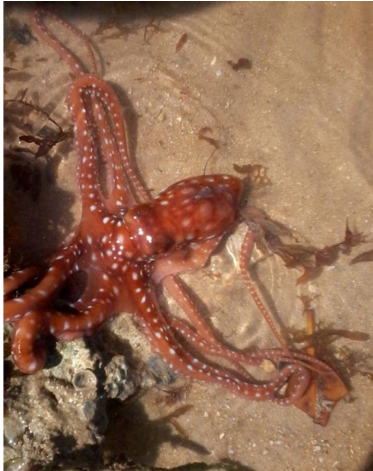
Figure 1. Callistoctopus sp. specimen found in a coastal reef of Porto Seguro (BA). First record of its occurrence in Bahia. (JESUS et al., 2015).