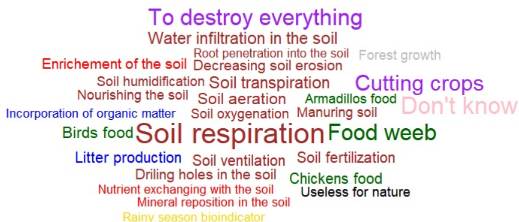
Figure 2. Answers of ADG peasants to the question "whats is the function of leaf-cutting ants in nature?" what is the leaf-cutting ant function in the nature? The ecological functions assigned to leaf-cutting ants prefer to Soil Aeration (in brown), Incorporation of Organic Matter (in blue), Nutrient Cycling (in red), Food webs (in green), Economical (in purple), Reforestation (in gray), Weather Forecast (in yellow). In pink it is represented the frequency of statements of not knowing the ecological function of ants and in black of the absence of function.

Agroecological Knowledge, Schooling, Control Method and Age were highly correlated with dimension 1, while the variables Gender, Profession and Opinion about Ants were more closely related to dimension 2. The variable Ecological Function of Ants correlated with both axes. These results indicate that these variables are determining factors in the differentiation of respondent profiles (Figure 3).