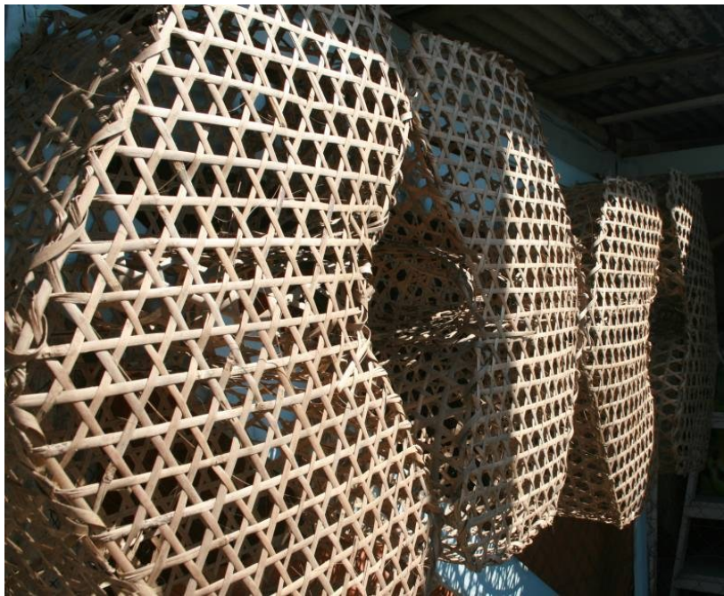
Figure 2. The “cove”, a fishing trap made of taquara (Bambusaceae) by the residents of Morro Grande, Apiúna, Santa Catarina.

In Ribeirão Taquaras, only the cipó (not identified) obtained a frequency of use greater than 50%. In Morro Grande the taquara is emphasized (86%) and was cited as the main plant used to manufacture a “cove” (Figure 2), a fish trap currently manufactured by the residents of this community. The taquara is followed by bamboo (71%) and cipó-liaça ( Philodendron sp.) (57%), which may also be used to manufacture a “cove”.