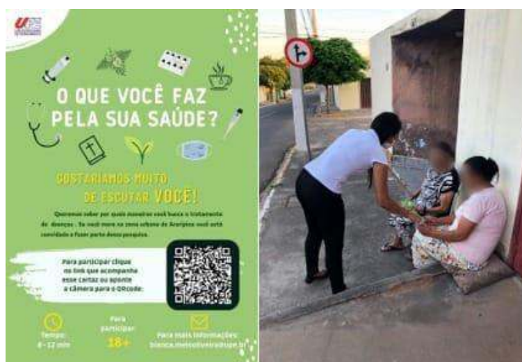
Figure 2. Digital leaflet and leafleting in the urban centre of the Municipality of Araripina, Pernambuco, Northeast Brazil.

medicinal plants or pharmaceuticals to treat the disease; and (ii) the occurrence of complementarity strategy (yes or no), in the case where the participant performed combined or sequential use of medicinal plants and pharmaceuticals. We used as independent variables (i) the origin (place of birth) of the participant in a rural environment (yes or no); (ii) the participant's contact with people living in a rural environment, measured by the frequency at which the person interacts with individuals from that environment, following the following scale: 0 - no longer has contact, 1 - twice a year, 2 - every three months, 3 - once a month, 4 -