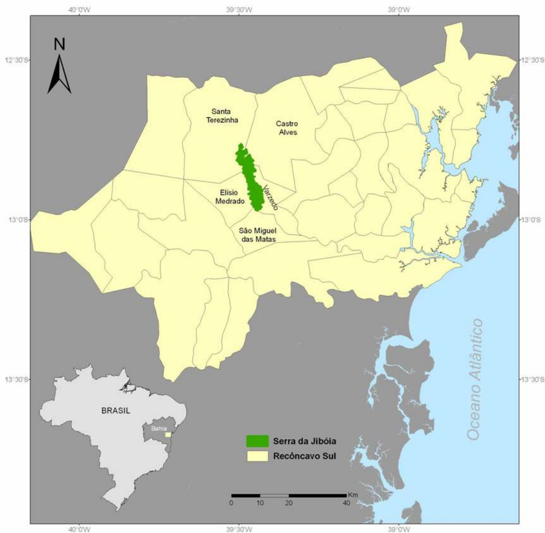
Figura 1. Location of Serra da Jiboia in the Recôncavo Sul region in the State of Bahia, Brazil.

All interviews were carried out with those participants who had a direct connection with the forest areas, such as hunters, firewood collectors and other groups that perform some extractive activity, as well as with those individuals who entered the forest for recreational, tourist or other purposes. Photographs, recordings and field notes were taken only when authorized by the interviewees, with the purpose of complementing data.