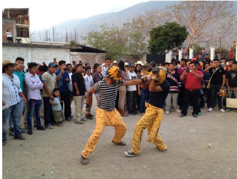
Figura 2. Ritual fight to propitiate rain.