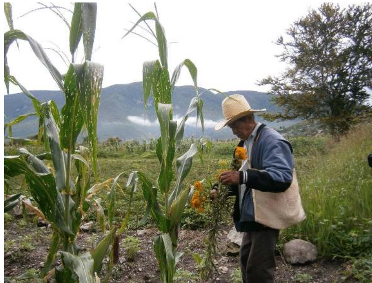
Figura 3. Offering in the milpa on the eve of Xilocruz.

It is worth noting that in the Mesoamerican world, the dead inhabited the same place as rain and seeds. An association that prevails between different peoples of Mesoamerican tradition (López Austin 2000). These festivities also show the relationship between the living and the dead in Acatlán, in which the dead do not inhabit a marginal place but actively participate in the community's life. So that they also work. For this reason, the community recognizes the dead's role in providing rain and food. A vision shared by other Nahuatl communities in Guerrero (Good 1996, 2004).