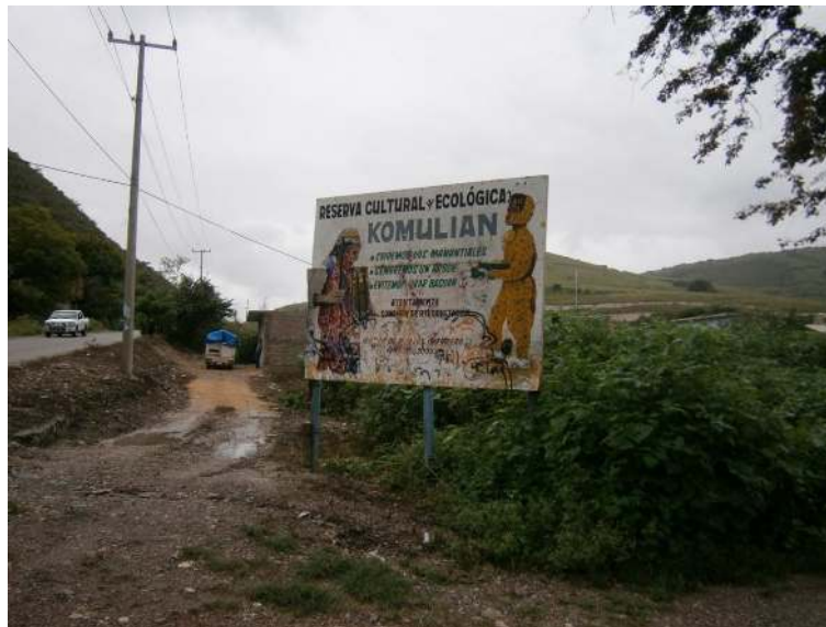
Figura 4. Community conservation area.

ple prayed for the end of the rain, but it did not stop. Hence, they concluded that maybe their behavior had been the cause of the disaster.