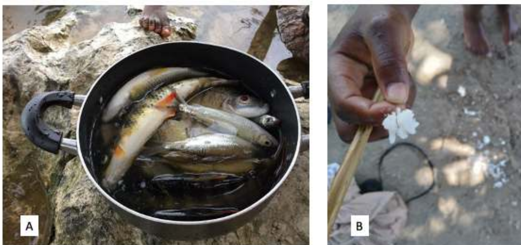
Figure 4. a) Several fish caught for dinner, including apaulobi and kuana . b) Cooked rice is attached to the fishing hook.