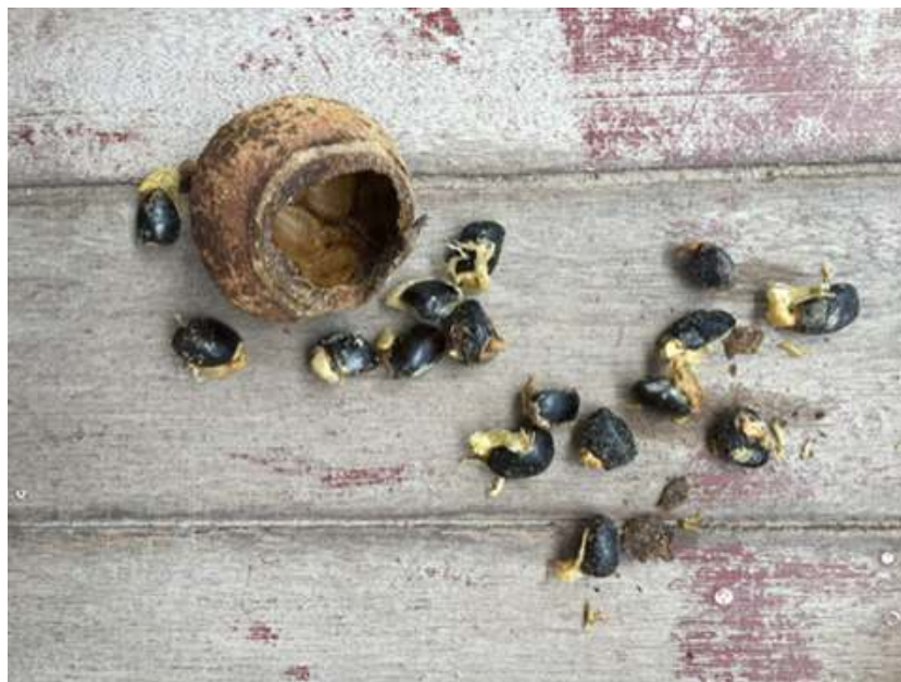
Figure 6. Opened fruit of Gustavia augusta , showing the black seeds and fleshy yellow aril, which is eaten by fish.