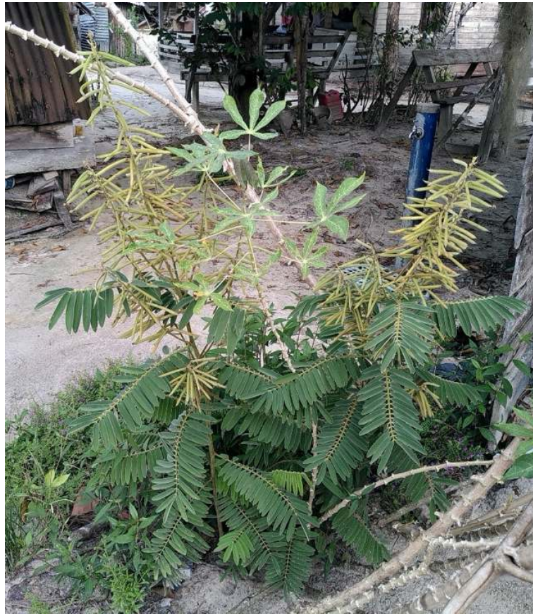
Figure 5. Fruiting individual of Bumbi (Au), Tephrosia sinapou , a shrub that is planted for its roots, to be used as a fish poison.