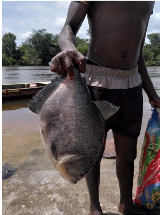
Figure 3. Young man showing a pilen (piranha), Serrasalmus rhombeus , caught with a net.