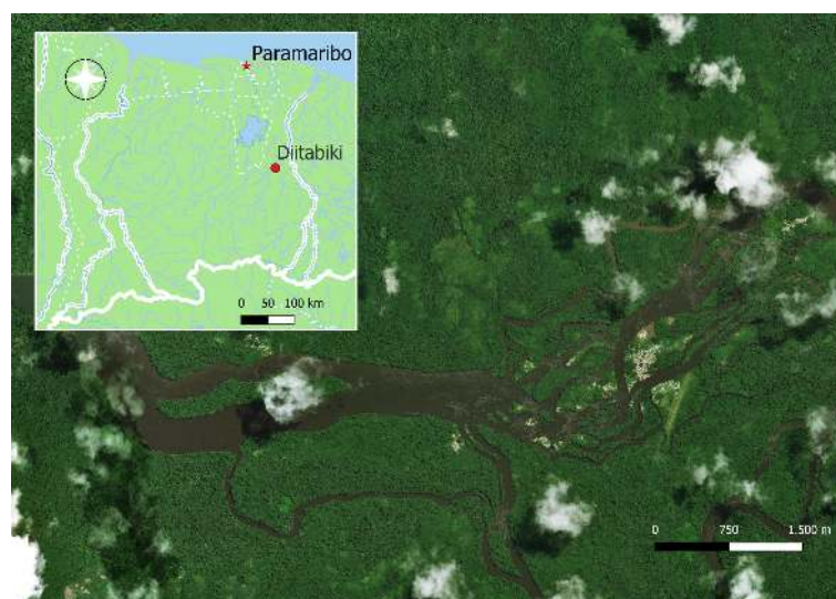
Figure 1. Location of Diitabiki along the Tapanahoni river in Suriname (inset). Satellite image of the village with its airstrip, surrounded by forests subjected to flooding.

The botanical inventory on useful plants was done along the riverbanks in a boat and along two paths leading into the surrounding primary and secondary