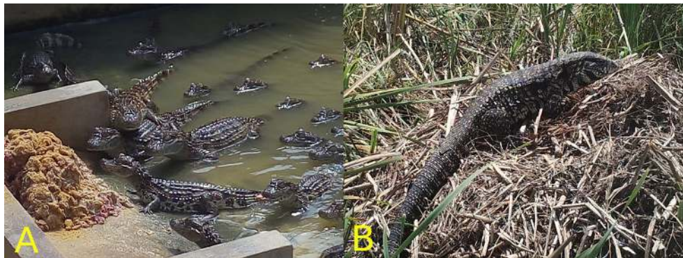
Figure 1. Reptiles used to obtain the fat and oil samples used in this study. a- Individuals of captive Broad-snouted caiman ( Caiman latirostris ) from the sustainable use and conservation program "Proyecto Yacaré", Santa Fe, Argentina. b- Wild individual of Argentine Black and white tegu ( Salvator merianae ) in Santa Fe, Argentina.