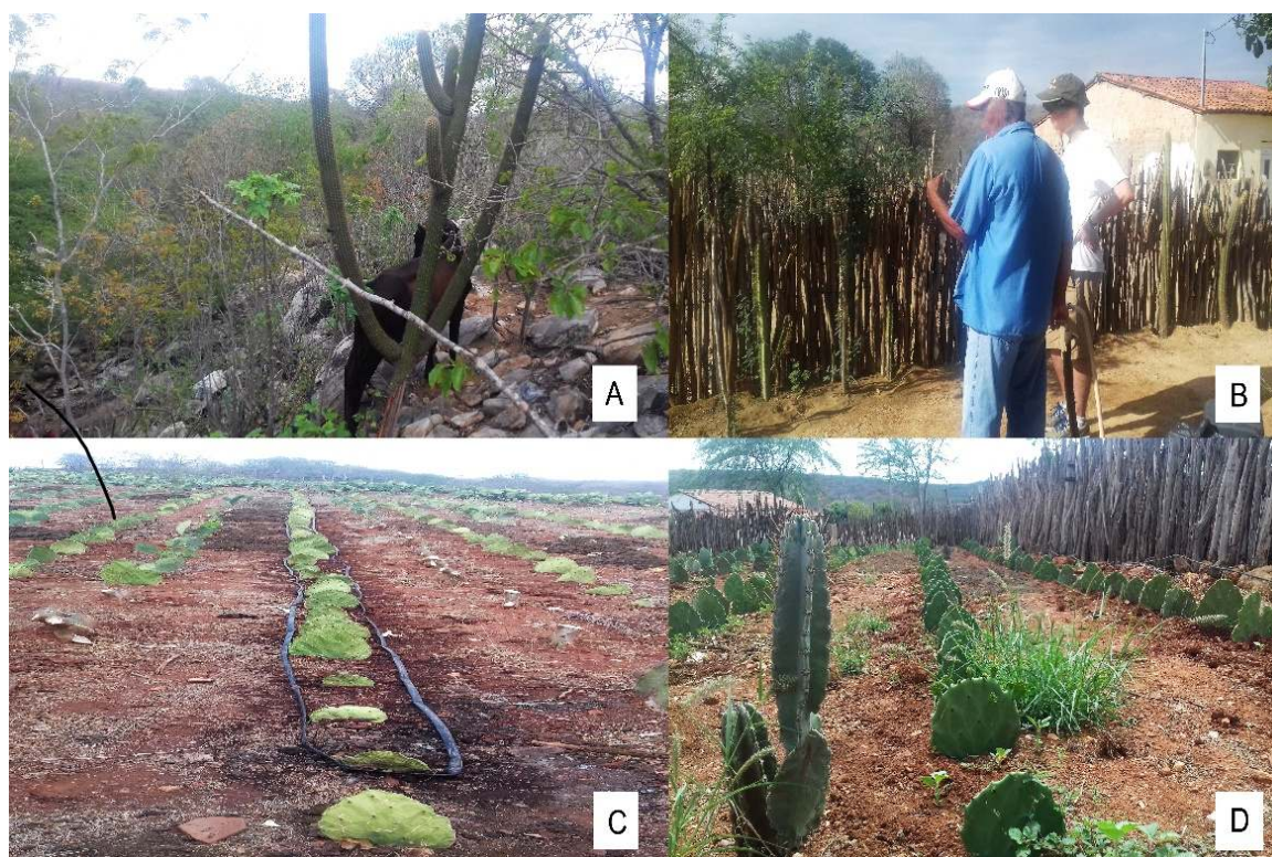
Figure 2. Vegetative propagation irrigated by dripping in the community of Tapera (Cabaceiras, Paraíba, northeastern Brazil). A: Pilosocereus pachycladus F. Ritter in natural areas for fodder purpose; B: Plantation of Cereus jamacaru DC. subsp. jamacaru and Pilosocereus pachycladus F. Ritter in live fences; C: Plantation of Opuntia ficus-indica (L.) Mill.; D: Associated cultivation of Opuntia ficus-indica (L.) Mill. and Cereus jamacaru DC. subsp. jamacaru

made of species native to the Caatinga; then they take the animals to feed in the place where species were burnt or take the burnt species to feed the animals near the residences (Figure 3).