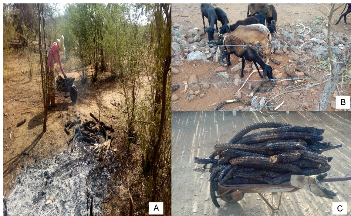
Figure 3. Pilosocereus pachycladus F. Ritter specimens subjected to burning for fodder purpose in the rural communities of Tapera, Caiçara, Caruatá de Dentro, and Rio Direito (Cabaceiras, Paraíba, northeastern Brazil). A: Burning performed by a resident; B: Animals feeding on burnt plants in loco; C: Use of a wheelbarrow to take the burnt vegetative parts to near the residence.

it can regenerate. Nevertheless, cutting management of cladodes, recorded in our study, may be associated with some type of management for protection, as it was found in Mexico (Casas et al. 1997b, 2014, 2017). Concomitantly, informants' awareness of parsimoniously using the cacti in natural areas is considered in the literature as "tolerance management" (Casas et al. 2014). The tolerance management is typical of semi-arid regions, due to conservation activities and socio-cultural value of cacti for semi-arid populations, mainly for animal feed.