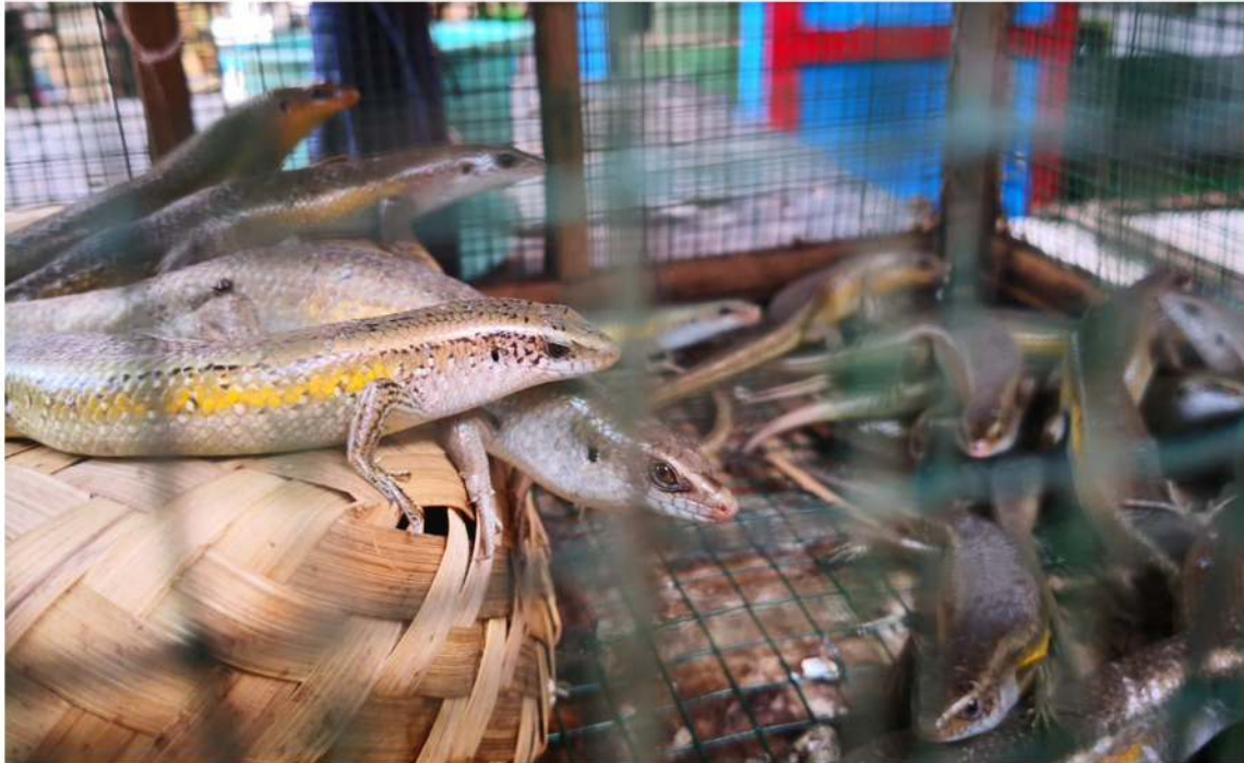
Figure 2. Common Sun Skinks Eutropis multifasciata for sale at Pasar Satwa dan Tanaman Hias in Yogyakarta. Species identification confirmed by M.Auliya.

treat skin problems. The vendor also stated that the Tokay Gecko was better than Common Sun Skinks in this respect but could not explain why. Another vendor stated that the Common Sun Skinks are used by eating them whole or grilled on the barbeque.