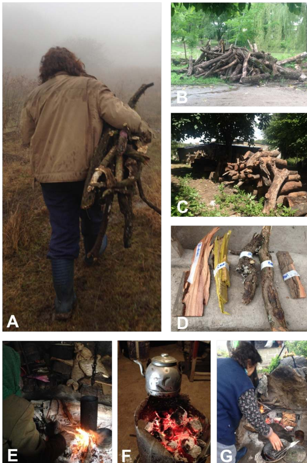
Figure 2. Firewood for the criollos of Sierra de Ancasti, Catamarca, Argentina. A: collection. B, C: stacks of firewood (B: Salix humboldtiana , C: Shinopsis lorentzii ). D: diversity. E, F, G: applications and uses (food preparation).