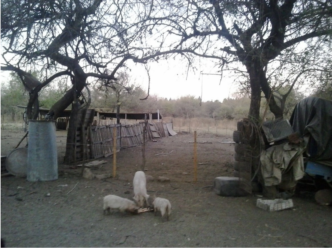
Figure 10. Corrales