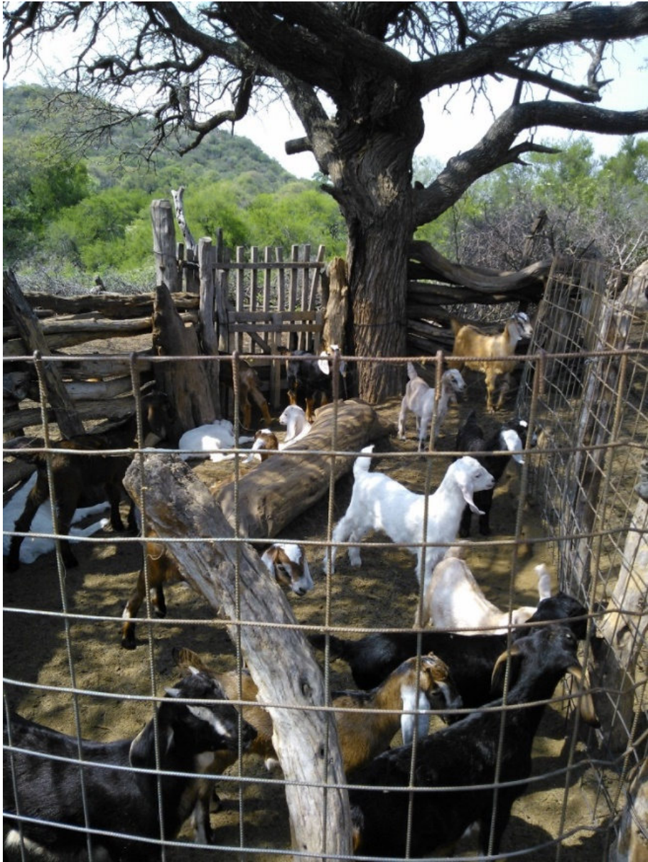
Figure 9. Corrales