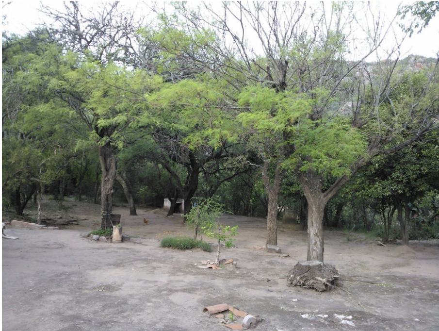
Figure 4. Patio . Protection of several Prosopis sp.