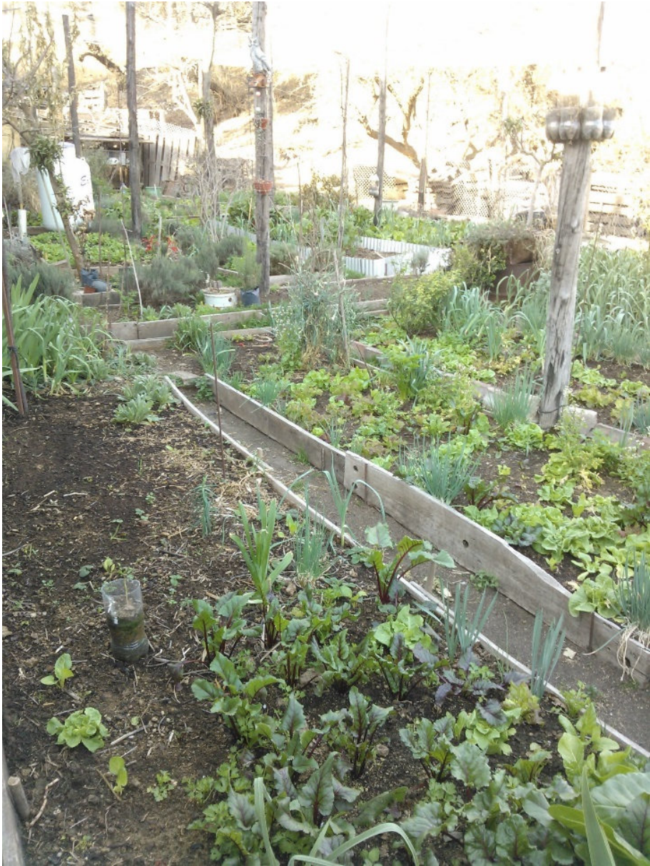
Figure 3. Orchard