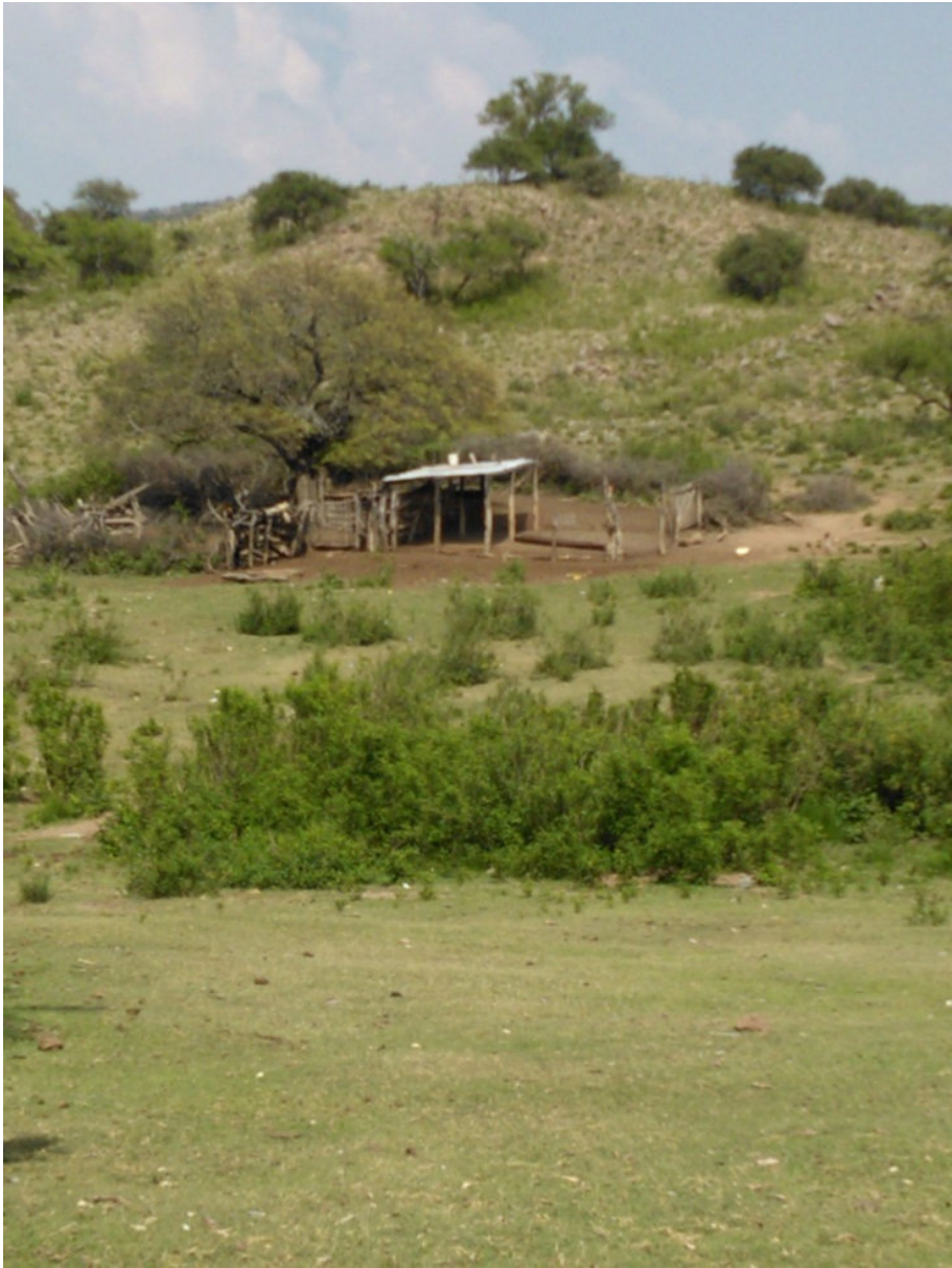
Figure 8. Corrales