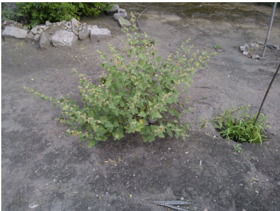
Figure 5. Patio . Tolerance of Sphaeralcea cordobensis