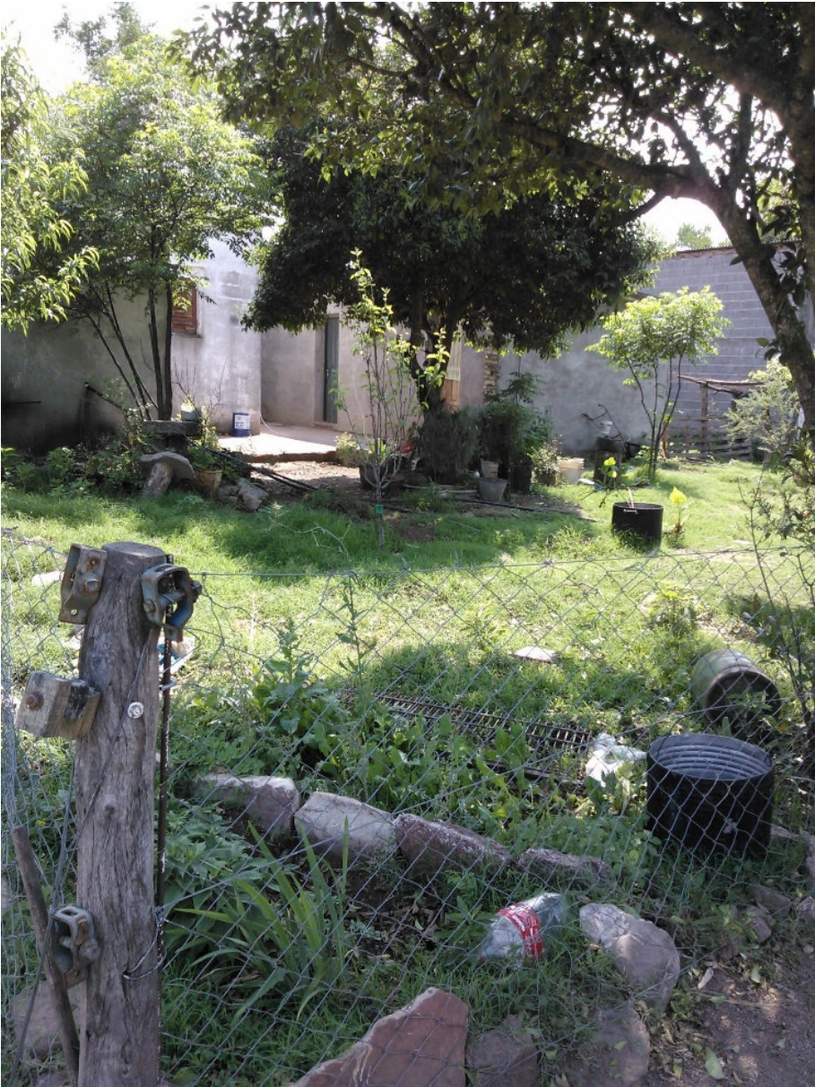
Figure 2. Garden