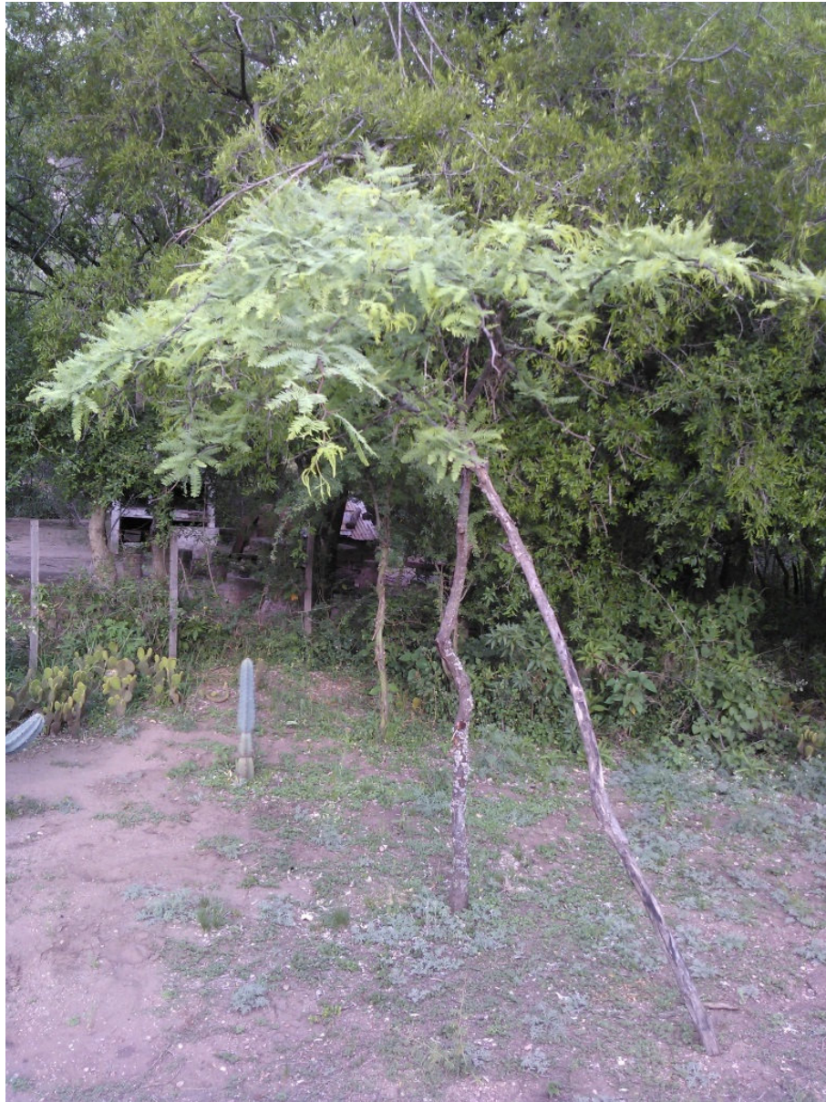
Figure 6. Patio . Protection of several Prosopis sp.