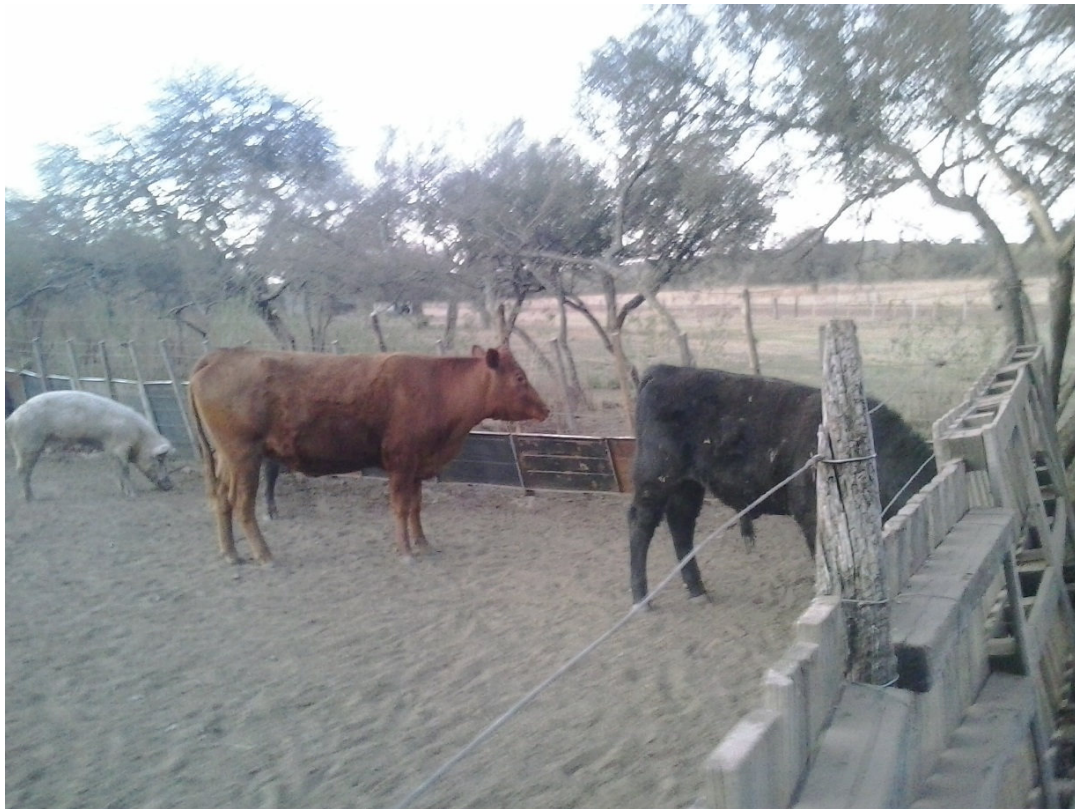
Figure 12. Corrales