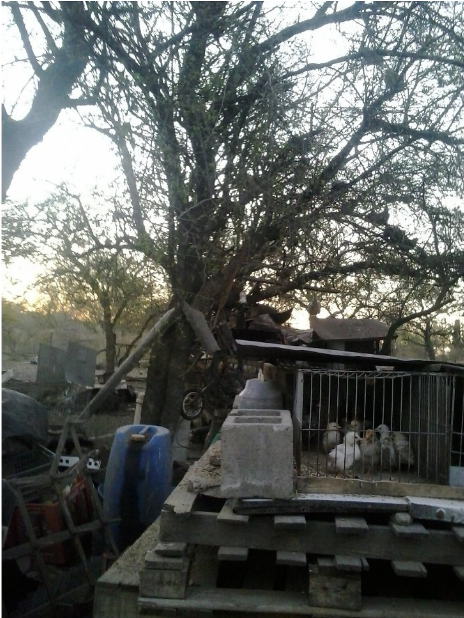
Figure 11. Corrales