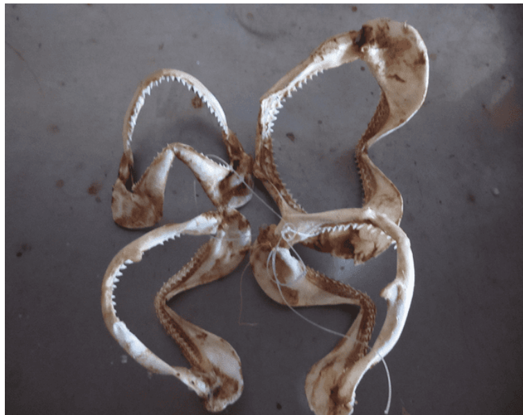
Figure 2. Jaws sold in Canavieiras, Bahia, Brazil. Year: 2012.

ers, several therapeutic shark products used for both human and animals health (ethnoveterinary) are reported, as follows: