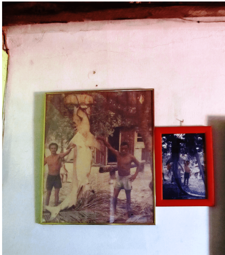
Figure 4. Framed photographs of hammerhead sharks ( Sphyrna sp.) used in the house decoration of a fisher from Ilhéus, Bahia, Brazil. Year: 2012.