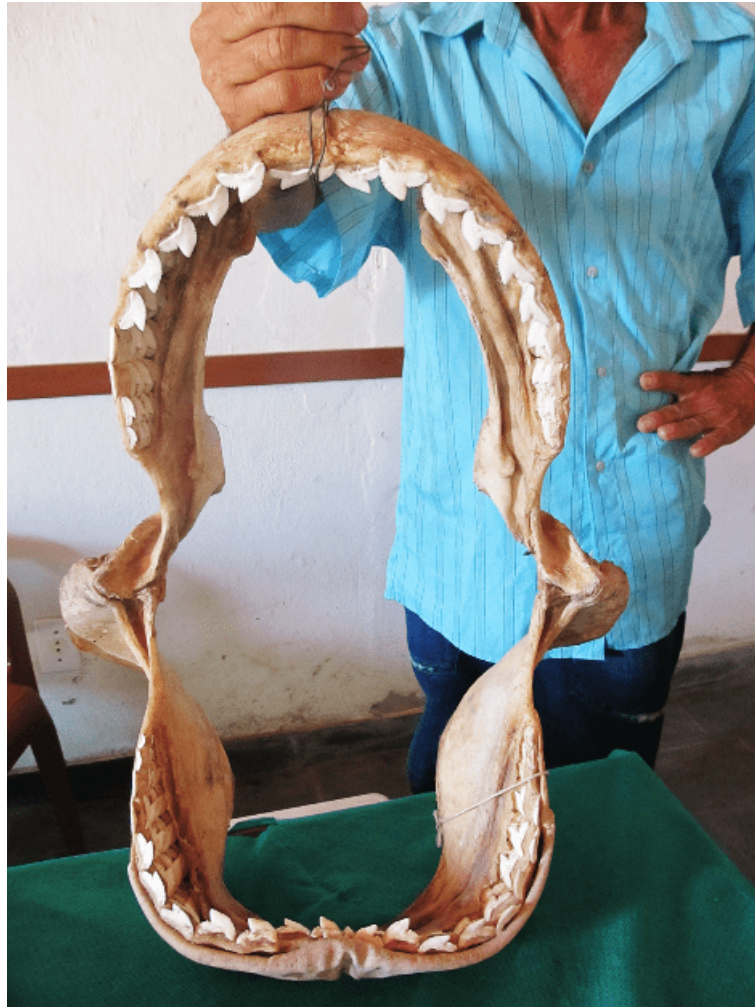
Figure 3. Tiger shark ( Galeocerdo cuvier) jaw that adorns a wall of the Z-20 Fishing Colony in Canavieiras, Bahia, Brazil.

to the management and conservation efforts of this relevant zoological group in line with the maintenance of food security, ways of life, and culture of coastal human groups that have been making diverse use of these fish over time. Involving local communities in conservation efforts is crucial, as they hold valuable traditional knowledge and have a vested interest in the sustainable use of shark resources.