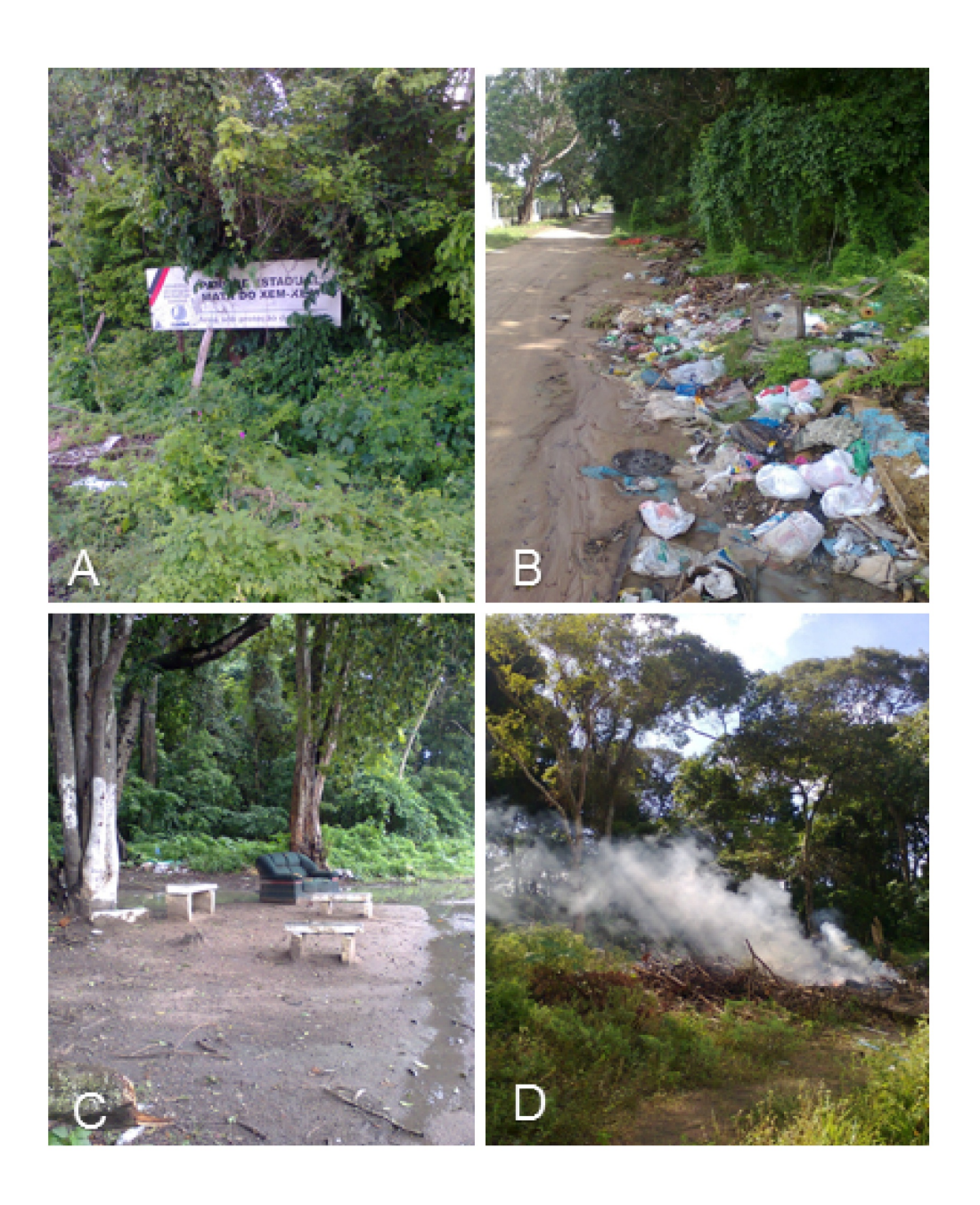
Figure 2. Problems identified at the Xem-Xem Forest State Park, Northeast Brazil: A – Indicative board of the Park in bad condition; B - Accumulated garbage at the edge of the Park; C - Limits of the Park used for landfill and construction of inappropriate places; D - Fire on the edge of the Park.

"The problem we have is the lack of security, not even for the animals, which are already few. The pollution here is also common. People turns out remains of animals such as chicken waste, and turns on the edge of the forest. Does not have a